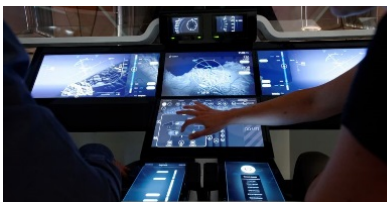
Figure 2 : Avionic 2020 tactile screens.