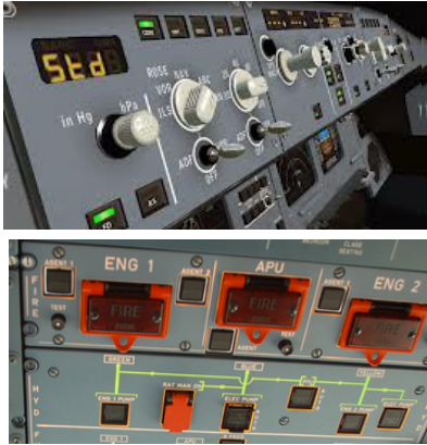
Figure 3 : (top) Airbus FCU physical buttons (Flight Control Unit); (bottom) overhead panel: guarded buttons.

the opposite prevent non reversible action (e.g. guarded buttons, Figure 3.bottom).