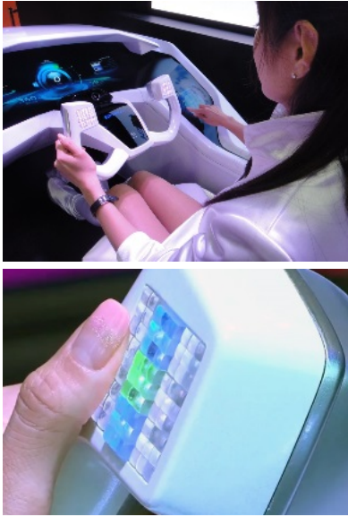
Figure 4 : Mitsubishi Emirai cockpit concept