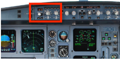
Figure 1. a) Navigation and flight displays in the cockpit of a TB20; b) buttons of the EFIS (Electronic Flight Instrument System) control panel that control the display mode of the navigation display (ND) (2 nd from the left).