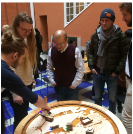
Figure 6-9: Public Exhibition